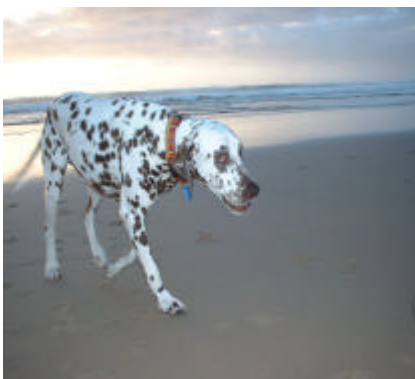
SPOT an 8 yr old p/b Dalmatian has mild epilepsy still waiting for a loving home rescued by ARRГ.