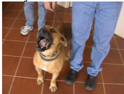
' GIDGET ' has suffered much abuse and we were able to rescue her. Covered in sores and scars and lame in the back leg. A Staffie x Ridgeback 4years old. Her leg has now been operated on and her progress is looking good. She has a great nature with people and children a one dog home preferred.