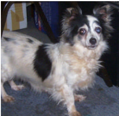
TRIXIE (above) a small 8 year old female terrier and BRUCY (below) an 8 year old male chihuahua, unwanted breeding dogs rescued by ARRГ