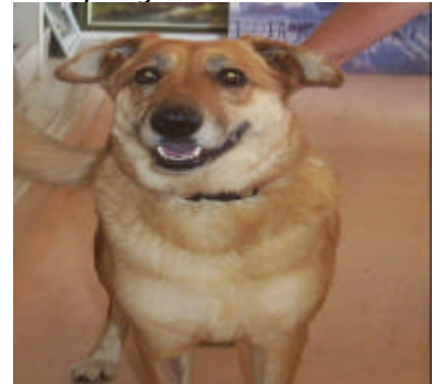
FATHOM a 4-year-old girl rescued and rehomed. She loves her new life in her beach home.