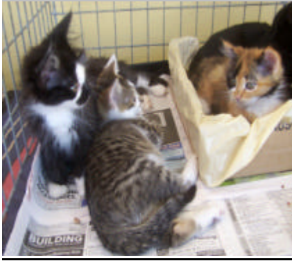
5 unwanted kittens dumped at Coraki rescued and now in care