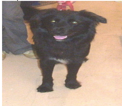
YOGI is an 18-month-old male Collie x New Foundland. Abandoned and found wandering on the beach at Byron Bay. A handsome and gentle boy he is waiting for his second chance.