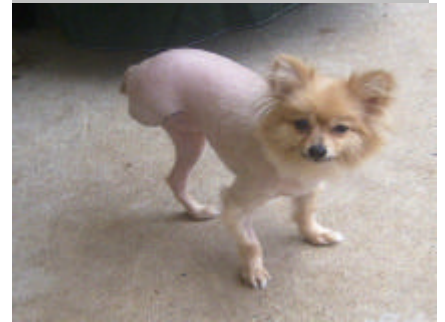
MOXY was left on the road her leg severely broken, which resulted with amputation. Sweet Moxy has been adopted by a wonderful family in Sydney