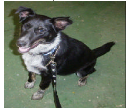
MATTIE a big pup abandoned on a property is now a much-loved family dog.