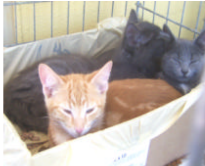
8 x 7 week old Russian Blue x kittens dumped near Alstonville.