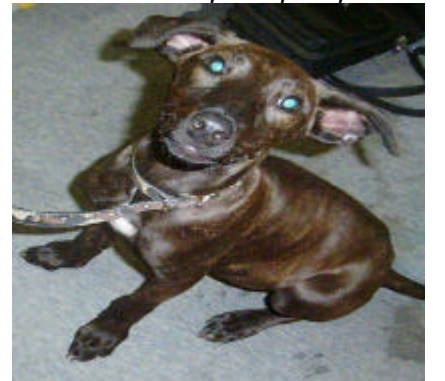
TWIGGY was abused and frightened. Now very loved by her new family