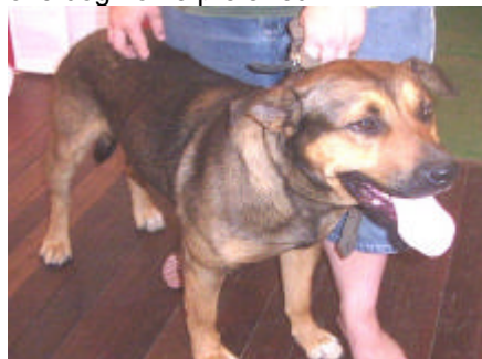
MURPHY a 2 year old Mastiff x Abandoned when his owner left the area. He is a medium sized dog with a great nature.